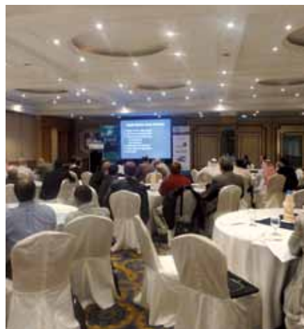
Attentive participants at the 2010 workshop.

Tight gas reservoirs of the Middle East have increasingly become targets for exploration assessments during the last few years as they possess the potential for substantial gas resources. With interest at an unprecedented level, an initiative for a series of workshops to address all aspects of the future of tight gas in the Middle East was launched. Two successful workshops were conducted in 2009 and 2010, and this 2011 workshop will follow on from the previous successful events.