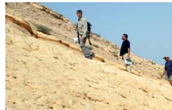
Regional landscape for geoscientists.

Commenting on the quality and experience of the contributors, workshop co-chairman Dr Jalal Khazanehdari (Schlumberger) said: 'ME not only contains well over 40% of proven oil and gas reservoirs globally but it has some of the most challenging reservoir rocks such as tight classics, fracture carbonates, oil shale, with even more deep and tectonically and geologically complex reservoir structures. This workshop is an ideal venue to bring together some of the experts from both academic and the oil and gas industry to discuss their experiences and share their knowledge as well as