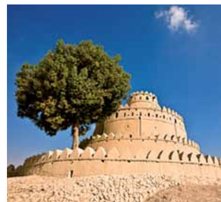
Jahili Fort, Al Ain.

Conference delegates will also be entitled to visit the palace of His Highness the late Sheikh Zayed Bin Sultan Al Nahyan. Built in 1937, the palace was Sheikh Zayed’s residence in Al Ain until 1966, before being converted into a museum and opened to the public in 2001. Dinner will follow after the guided visit.