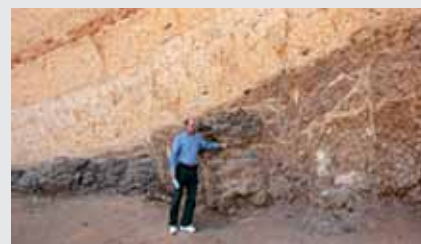
Well exposed outcrops.