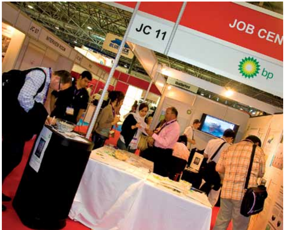
Getting the job done at the Vienna 2011 Job Centre.

A few months earlier, from 2–5 April 2012, EAGE will organize for the fifth time its bi-annual conference & exhibition in Saint Petersburg. At