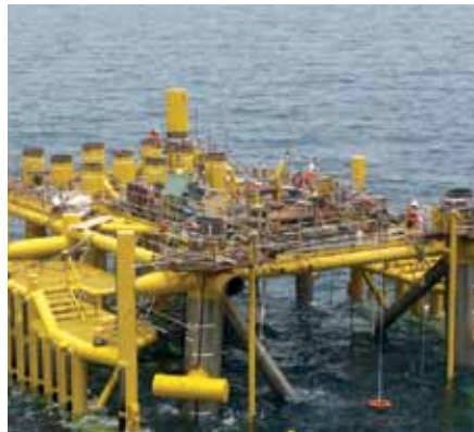
Karan offshore gas platform when under construction.

When in full production the field is designed to produce 1.8 billion standard cubic ft per day (SCFD) of raw dry gas by 2013.