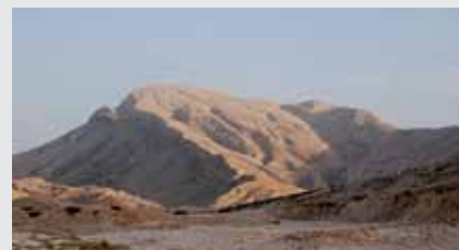
Spectacular view for field trip.

summary, an excellent morning and afternoon were spent in the field capped by a sumptuous lunch at the Hatta Fort Hotel.