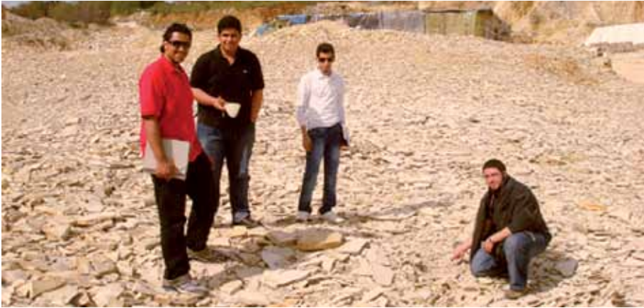
KFUPM students hunt for fossils in Germany.