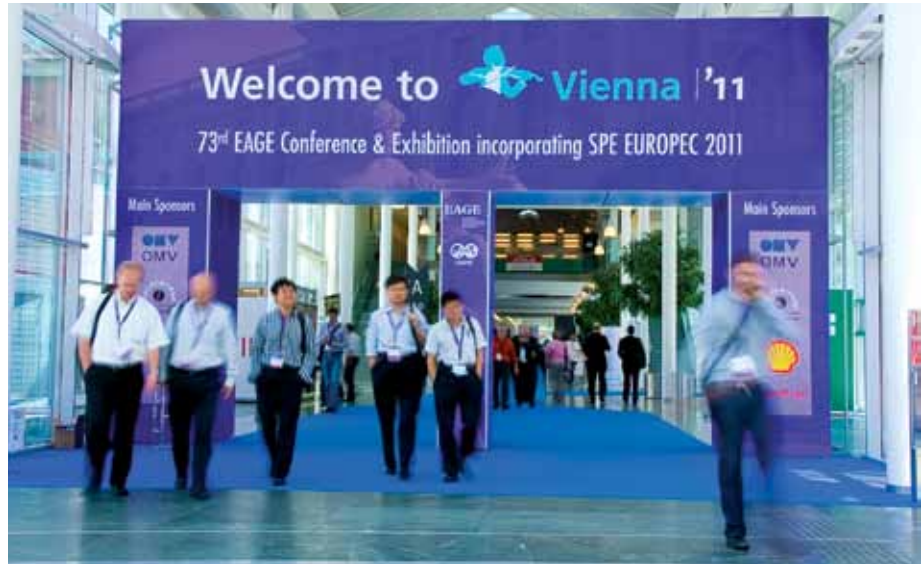
Entrance to Vienna 2011.

EAGE members always register at discounted rates, both for the workshops and for the larger events worldwide. EAGE's Annual Conference &